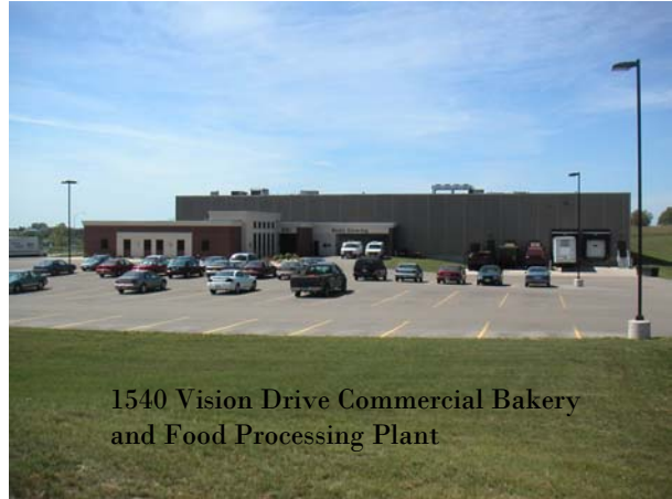
1540 Vision Drive Commercial Bakery and Food Processing Plant